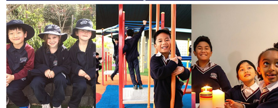
Entry via Car Park

Do you hold a current concession card? You may be eligible for CSEF funding which will be Deducted from your fees. You can access a form on the below link,.